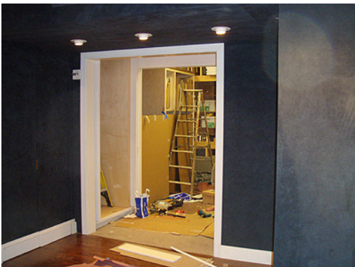
Construction in the Third Gallery