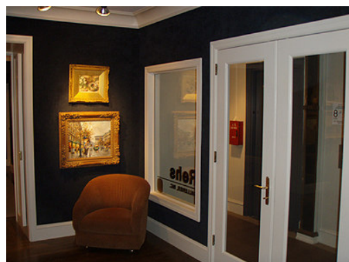
Center Gallery Looking Towards Front Door