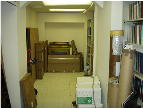
Almost Empty Storage Room

Below are a few updated photos of the gallery and the 'almost' empty storage room: