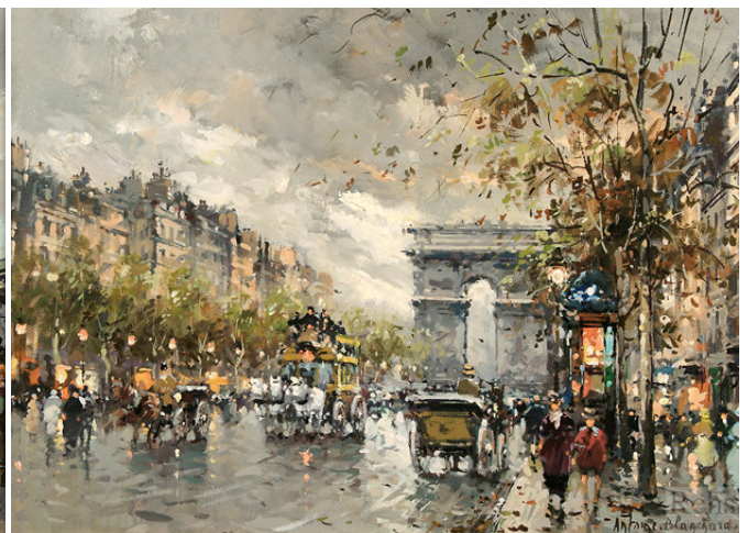
Antoine Blanchard Champs Elysees, Arc de Triomphe