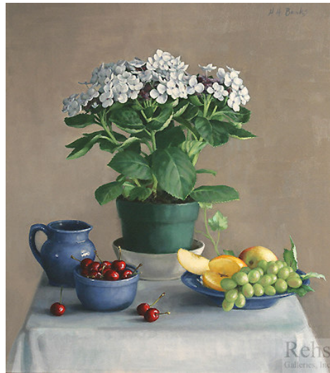
Holly Banks White Hydrangea and Fruit