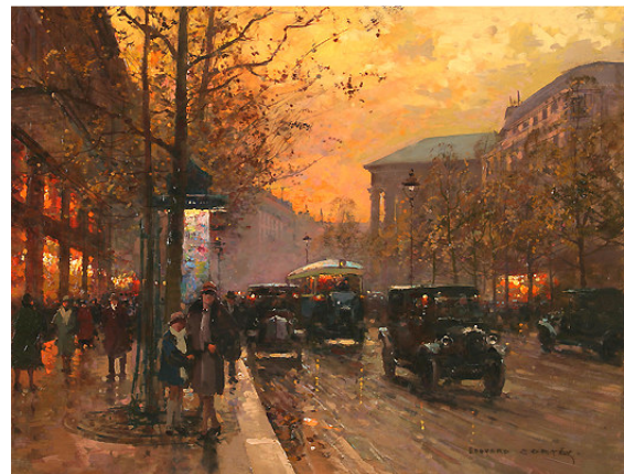
Edouard Leon Cortès Boulevard de la Madeleine 19 7/8 x 25 3/4 inches