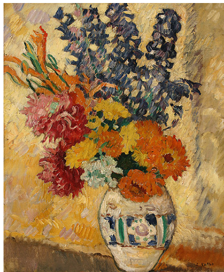
Louis Valtat Grand vase de fleurs 21 5/8 x 18 inches

Web Site Updates: We continue to update our biographies (Verboeckhoven, Antoine-Louis Barye, Comerre, Tenre and Zampighi) and have added, or will be adding, works by the following artists to our site: Valtat, Blanchard, Swatland, Banks, and Harris; images of a few are featured below: