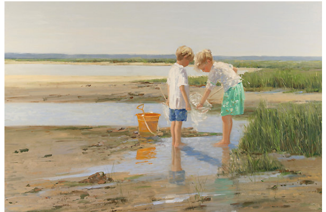
Sally Swatland By the Bay 24 x 36 inches

Next Month: Not sure. Since we will be on a forced vacation I might just bore you with – What I did on my summer vacation!!