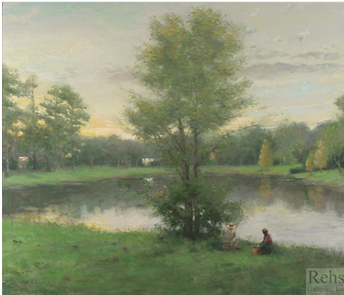
Holly Hope Banks Summer Landscape 28 x 33 inches