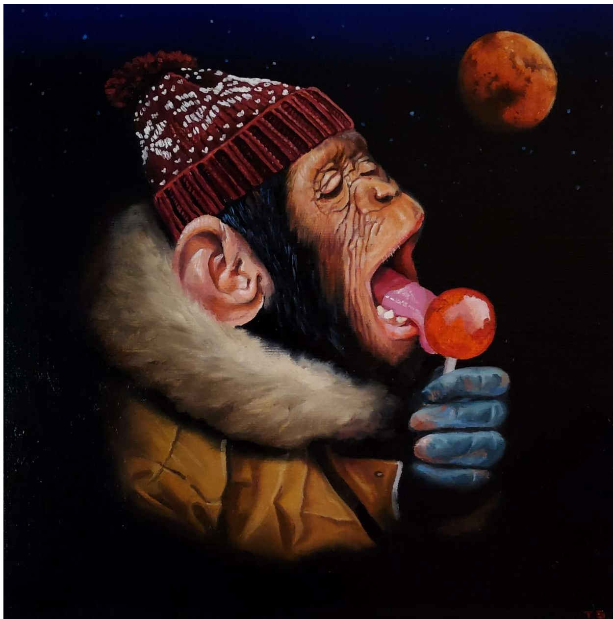
Tony South Planets Aligned Oil on paper 7.5 x 7.5 inches