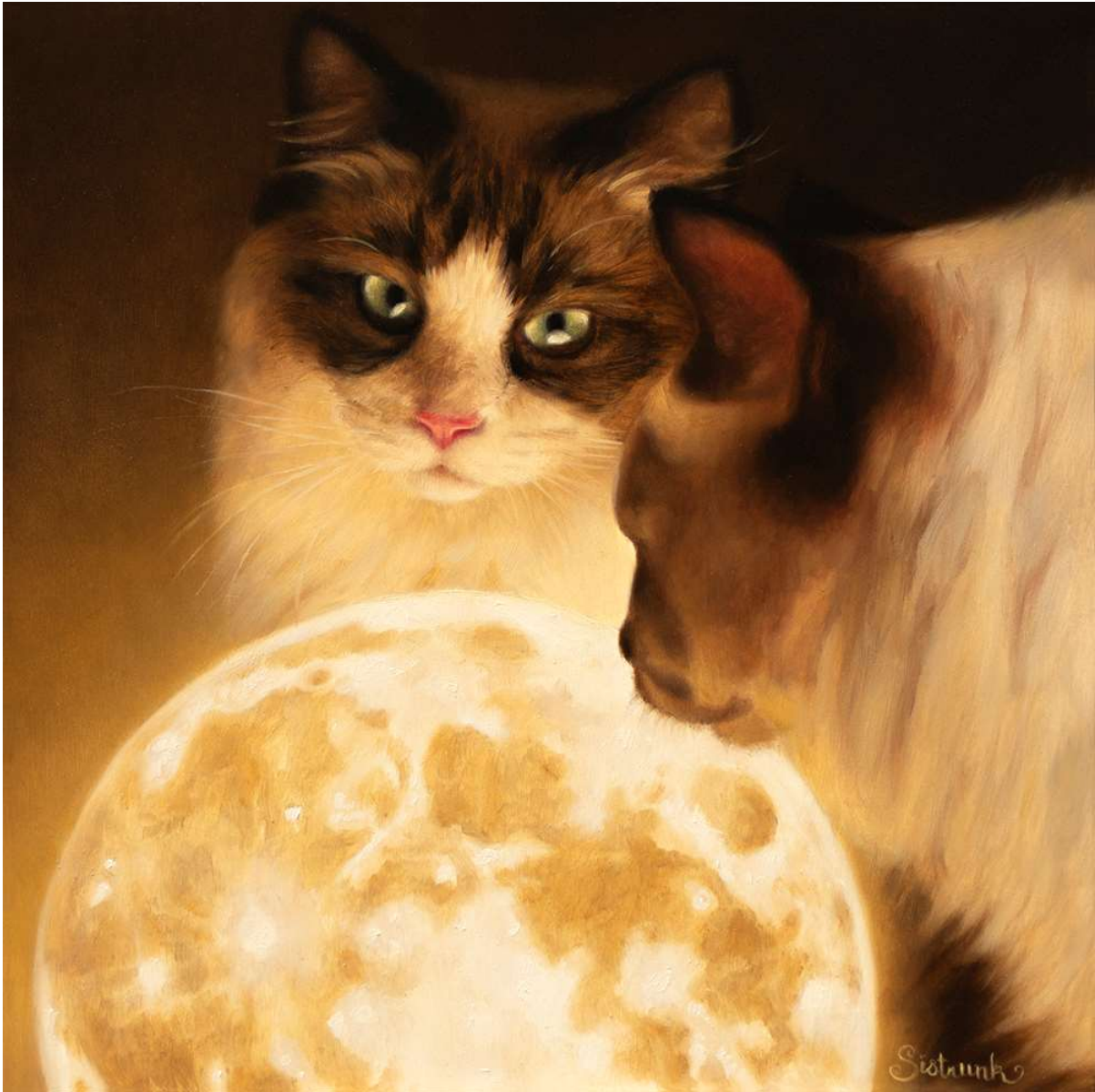
Beth Sistrunk Conjuring Oil on panel 8 x 8 inches