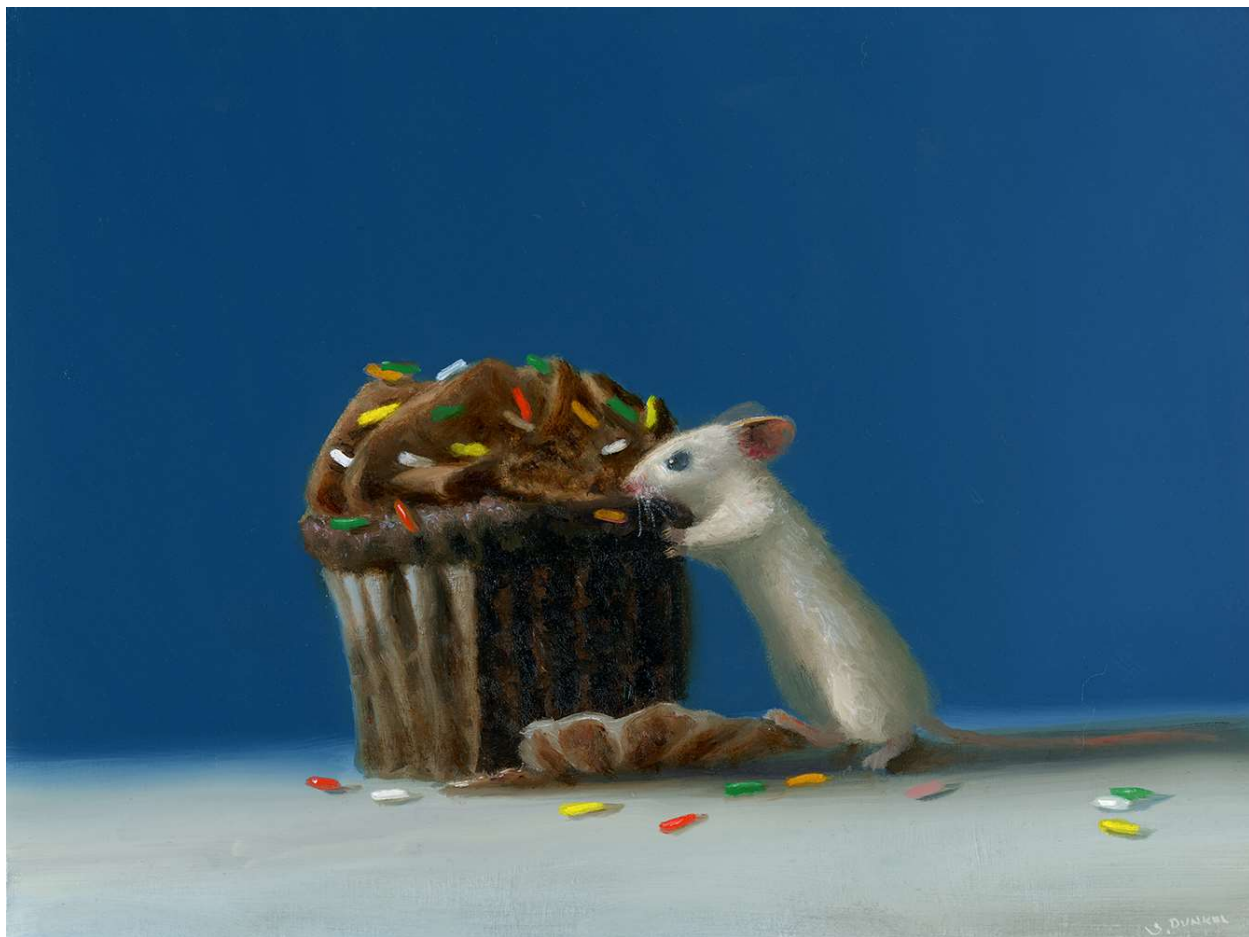
Stuart Dunkel Cupcake Caper Oil on panel 6 x 8 inches