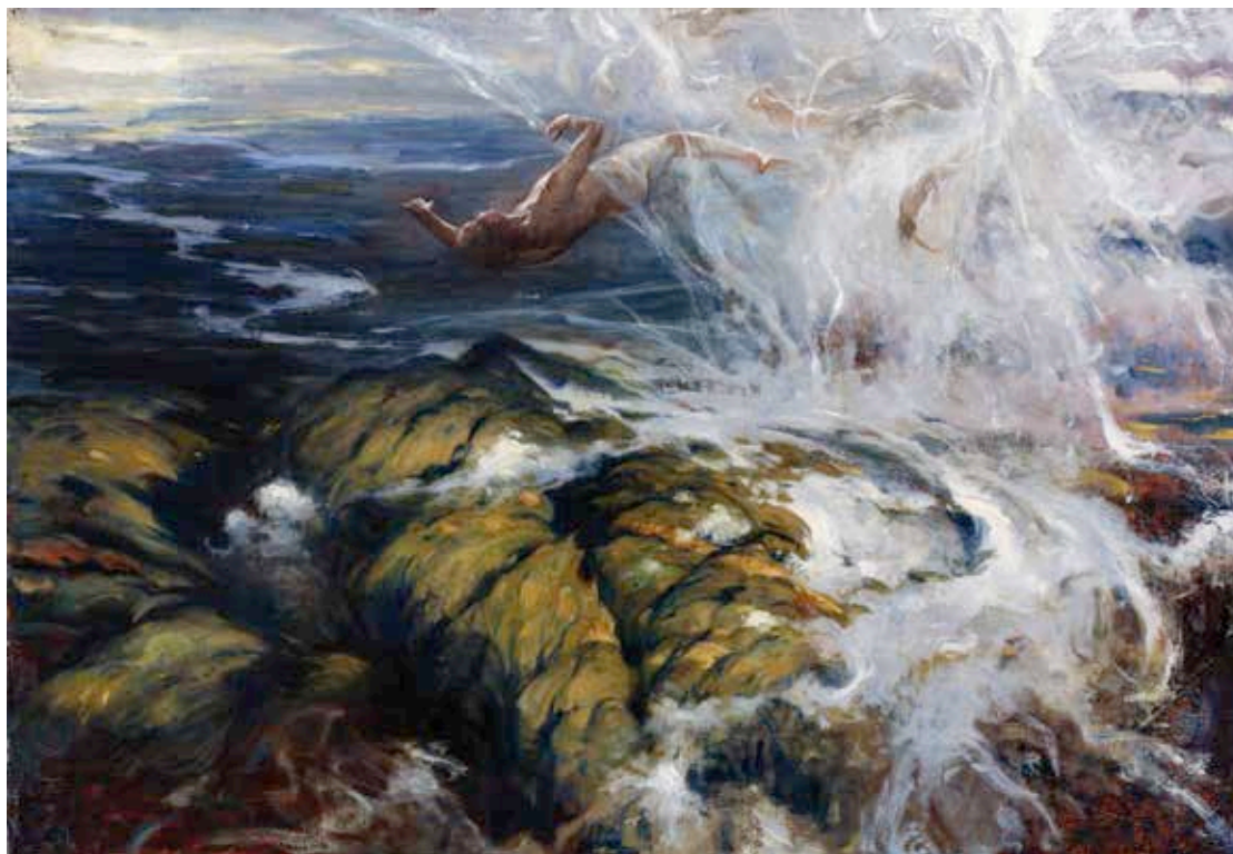
2 Joseph McGurl, Twilight Hudson River , oil on panel, 16 x 20"