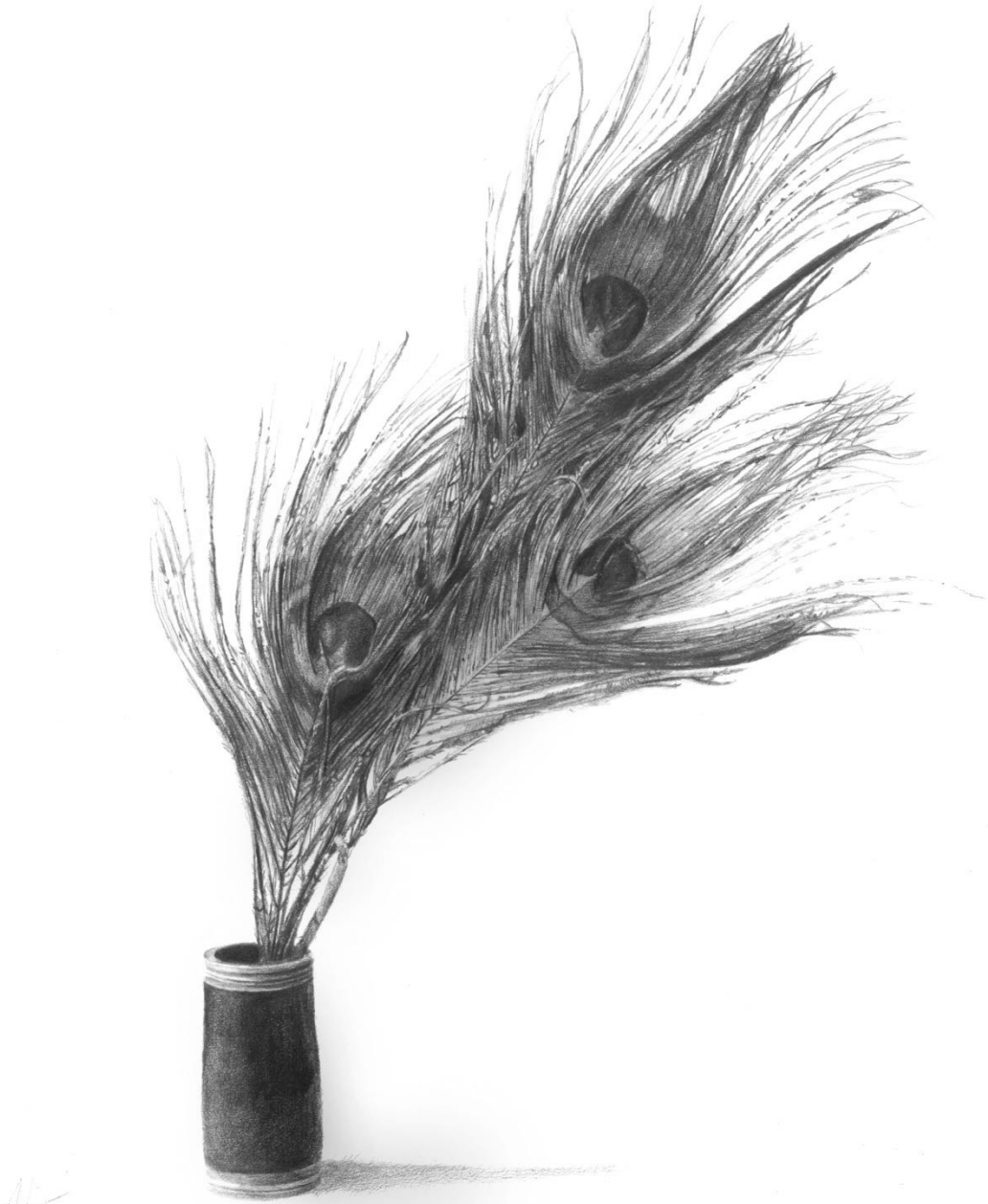
Emma Hirst Peacocking Charcoal and pastel on paper 10 x 8 inches