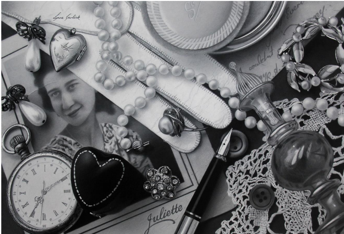
Lynne Garlick Received With Love Charcoal and pastel on paper 13 ½ x 20 inches