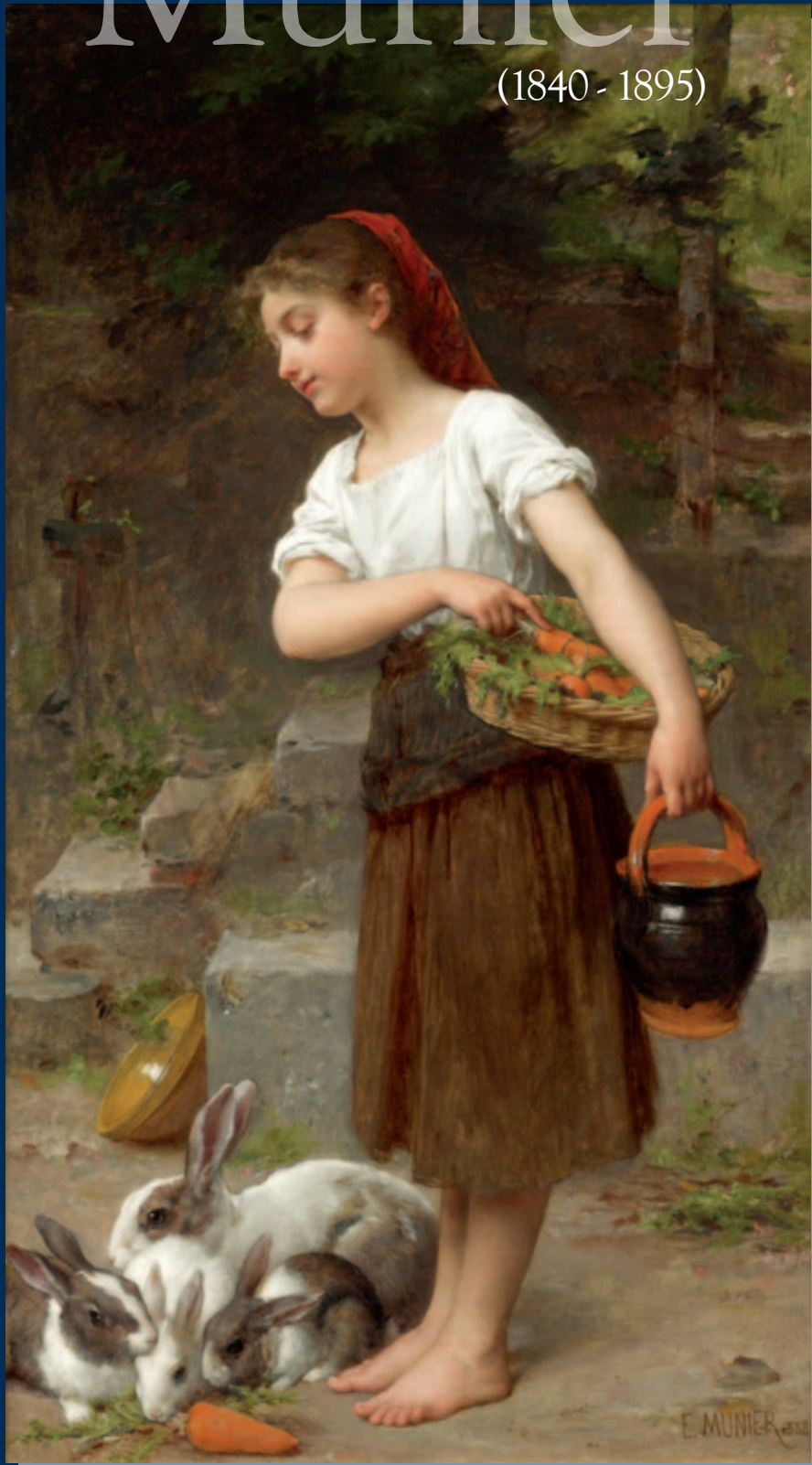
Feeding the Rabbits