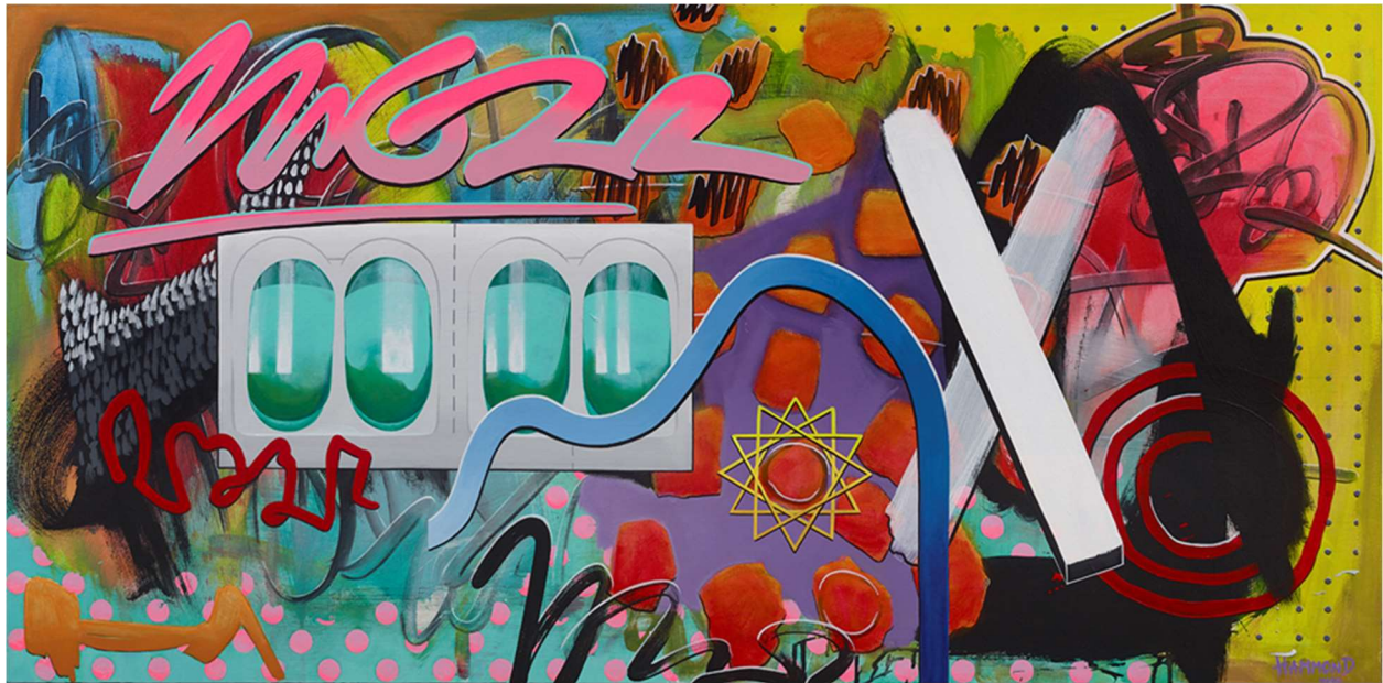
Toxic – 24 x 48 inches