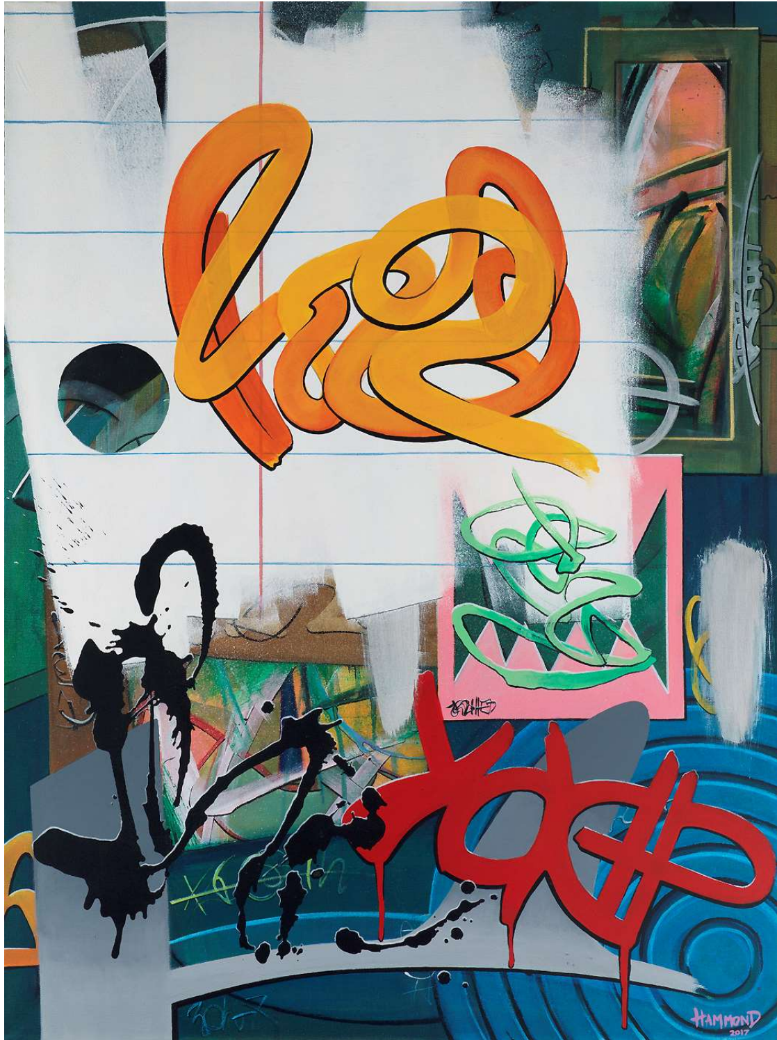
Deep Blue – 40 x 30 inches